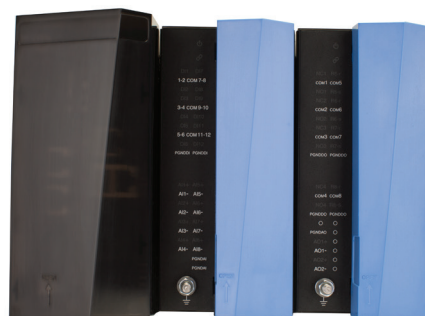
ACE1000 Remote Terminal Unit with covers