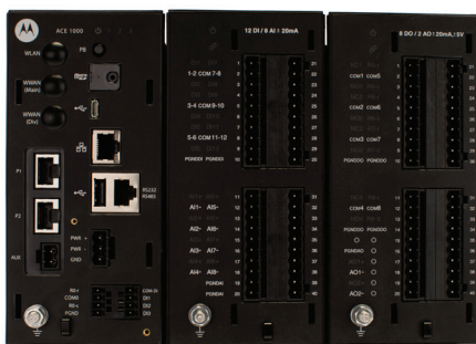
ACE1000 Remote Terminal Unit without cover